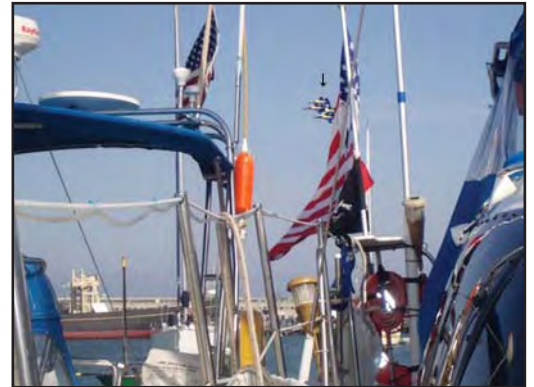
Fleet Week: the Blue Angels fly by SYC Flotilla