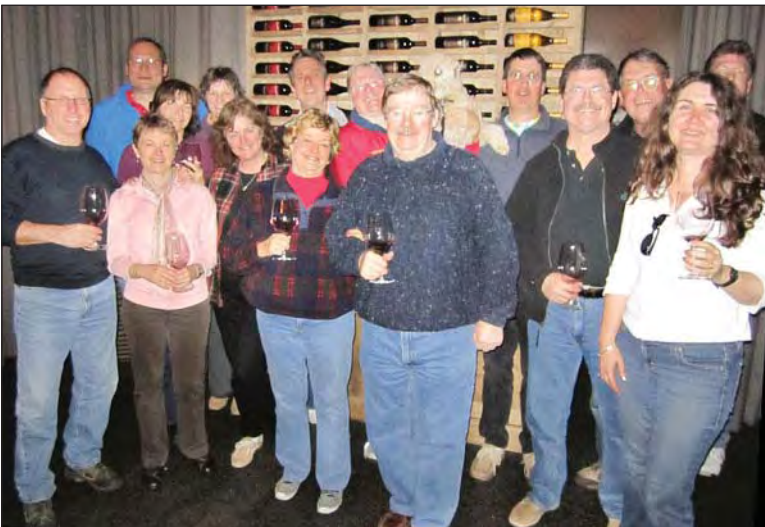
A late submission from last month: Photo of the group wine tasting at the Jack London Square Cruise Out

Be sure to give SYC advertisers your first consideration.