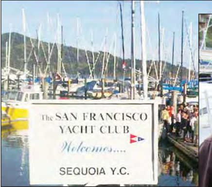
San Francisco Yacht Club welcomes SYC