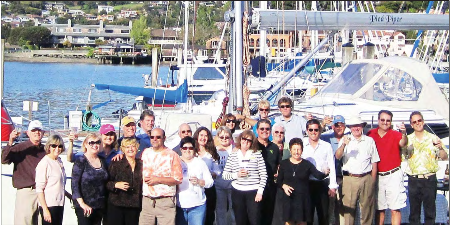
SYC at San Francisco Yacht Club Cruise Out