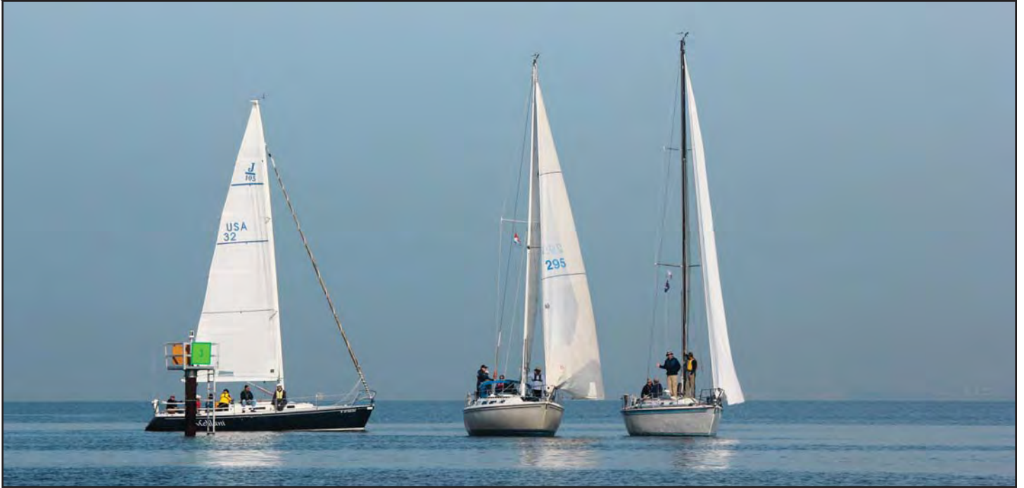
Doldrums in the Bay for one of the Winter Series.