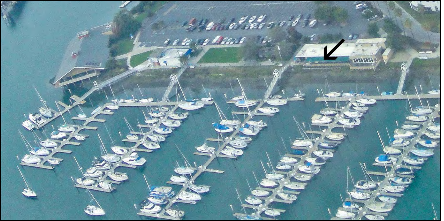
Aerial shot of the Marina and SYC, and the last shot of the old deck