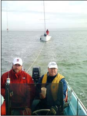
Sherry Warburton snapped Black Sheep being towed with her cell phone