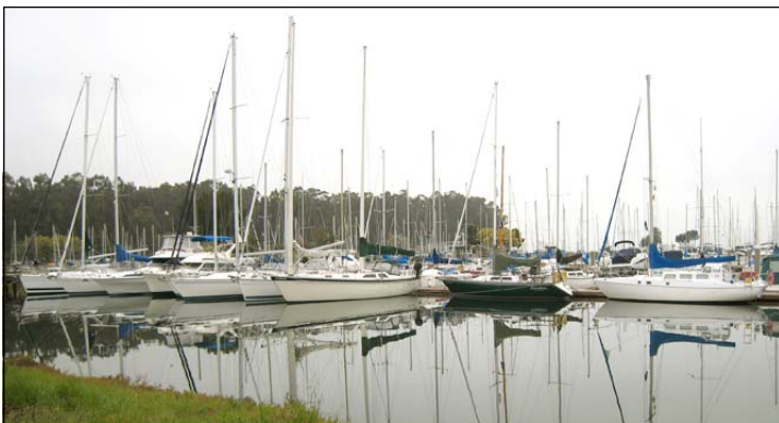
◀ Cruise out at Coyote Point Yacht Club for golf, a great Crab Dinner and fun