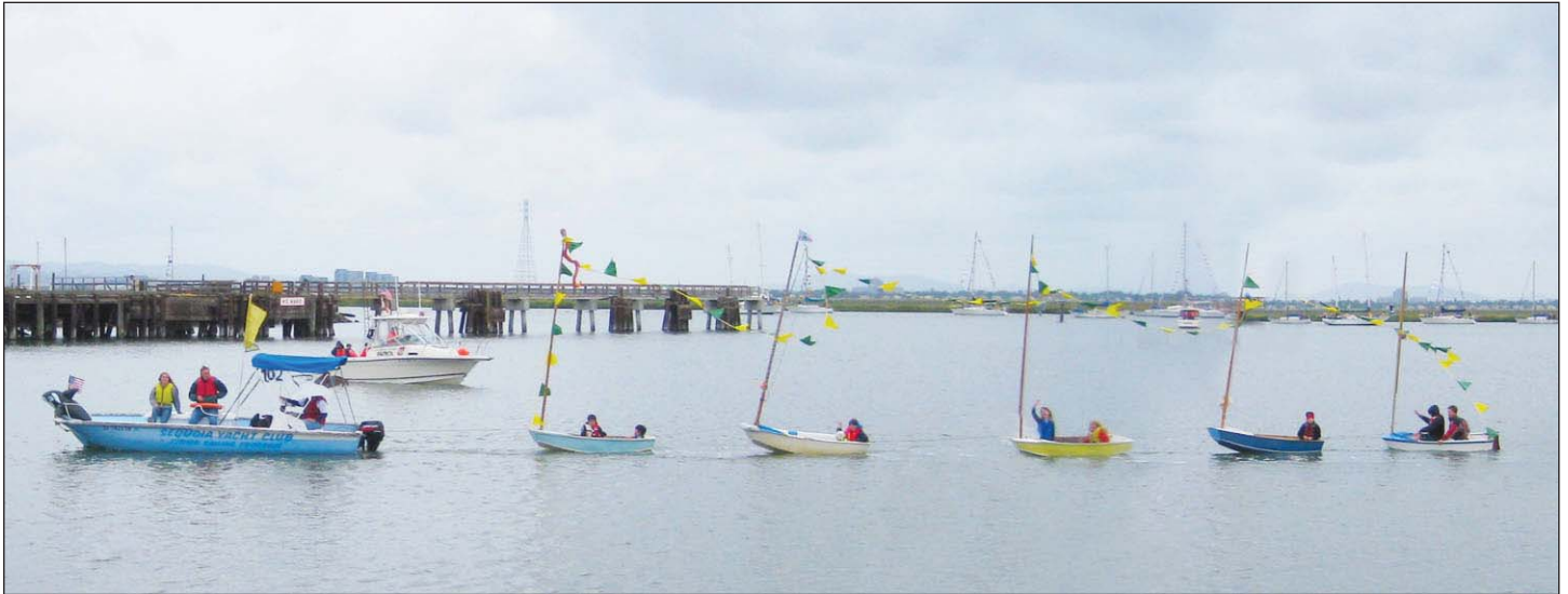
Sequoia Junior Sailing leads the parade of boats at South Bay Opening Day

Sequoia Yacht Club June 2011 Redwood City, CA