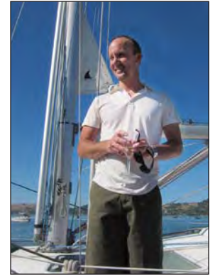
Beer Can Photos on pg 10