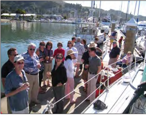
Sausalito Cruise Out