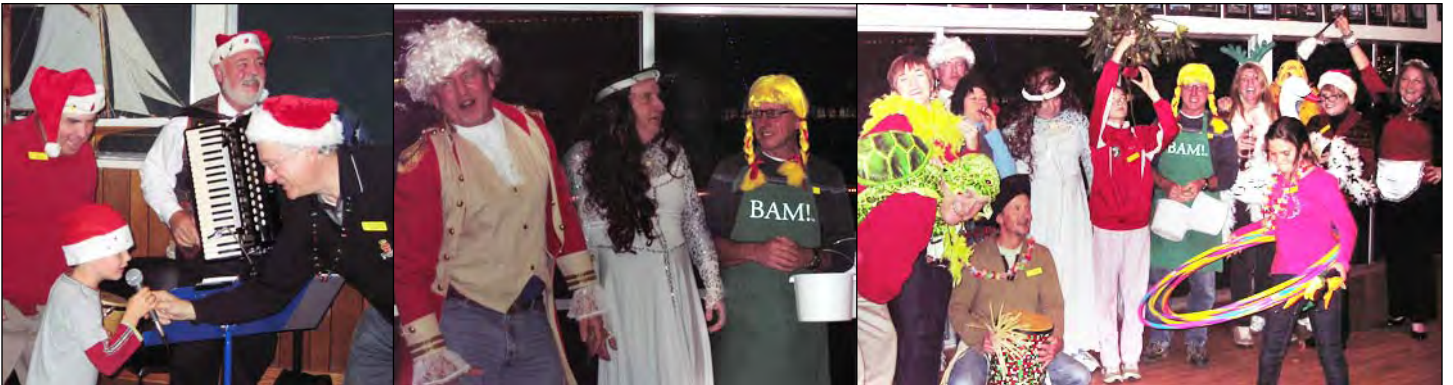
Lighted Boat Parade in Redwood Creek turning basin