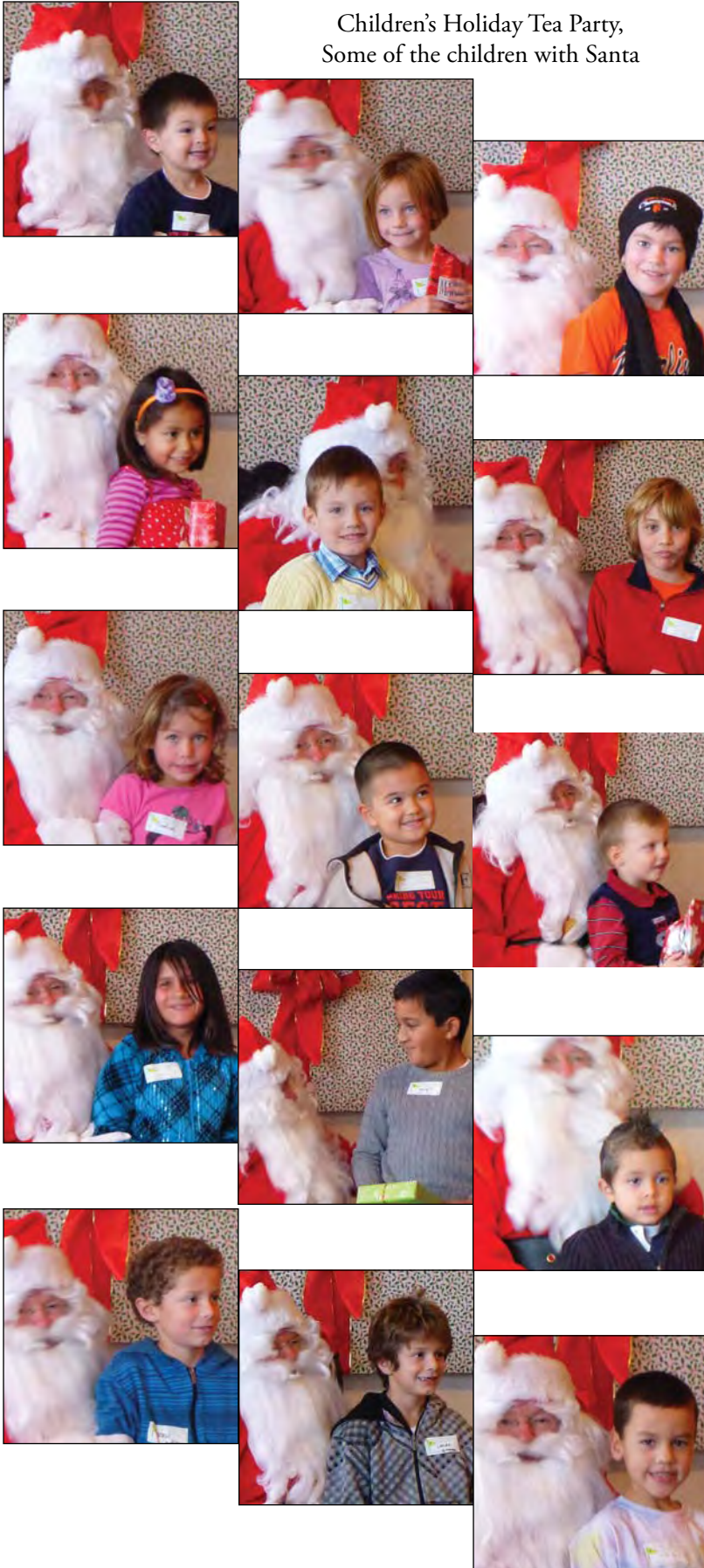
Children's Holiday Tea Party, Some of the children with Santa

Be sure to give SYC advertisers your first consideration.