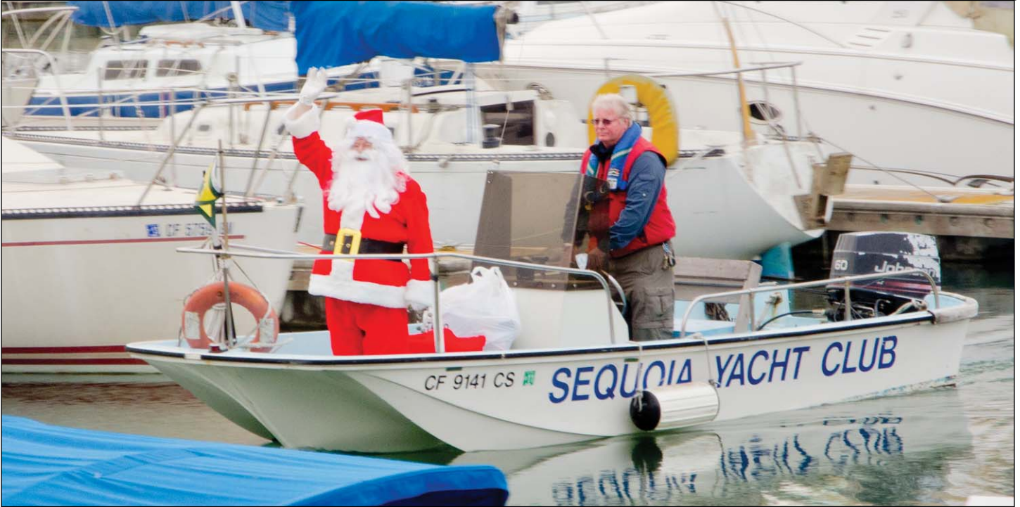
Santa arrives by boat to Sequoia Yacht Club