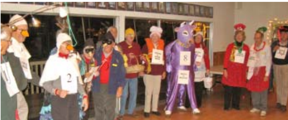
Cast of Thousands