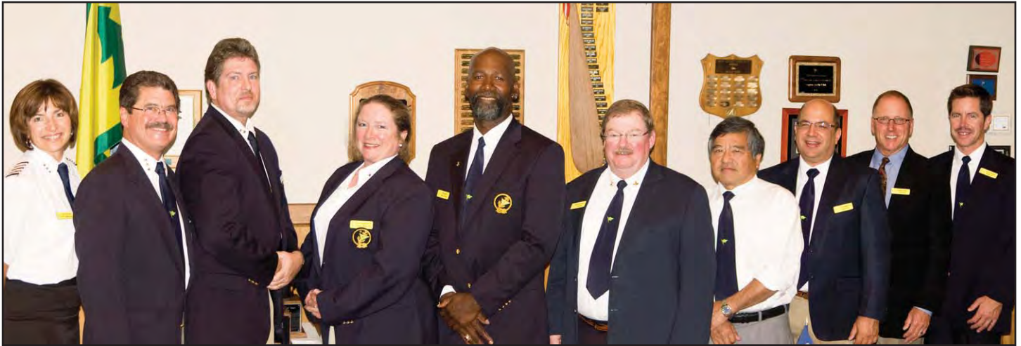
2010 Officers at the Installation Dinner, 11/07/09.

Sequoia Yacht Club P.O. Box 5548 Redwood City, CA 94063-0548