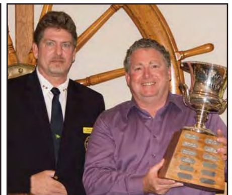
Richard Butts Iowa Cup - Most Pickups