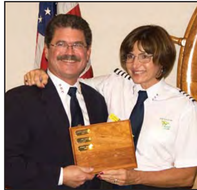
Byron Jacobs James Wyman Meritorious Service Award