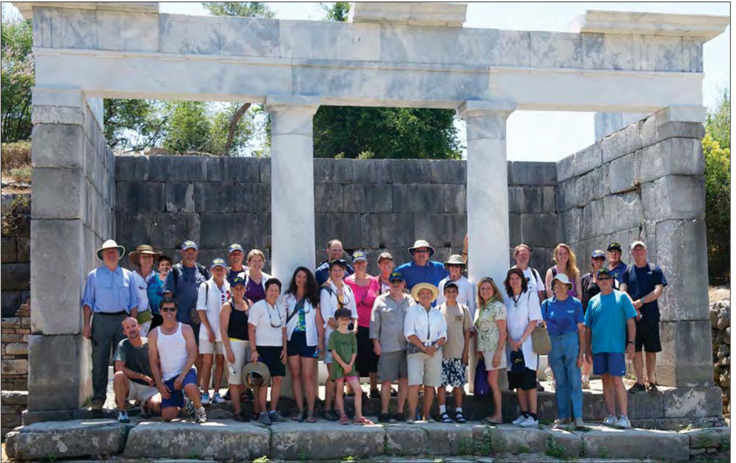
The SYC Turkey MegaCruise at Dalyan, on the reconstructed fountain in the ruins of the ancient Greek town of Kaunos