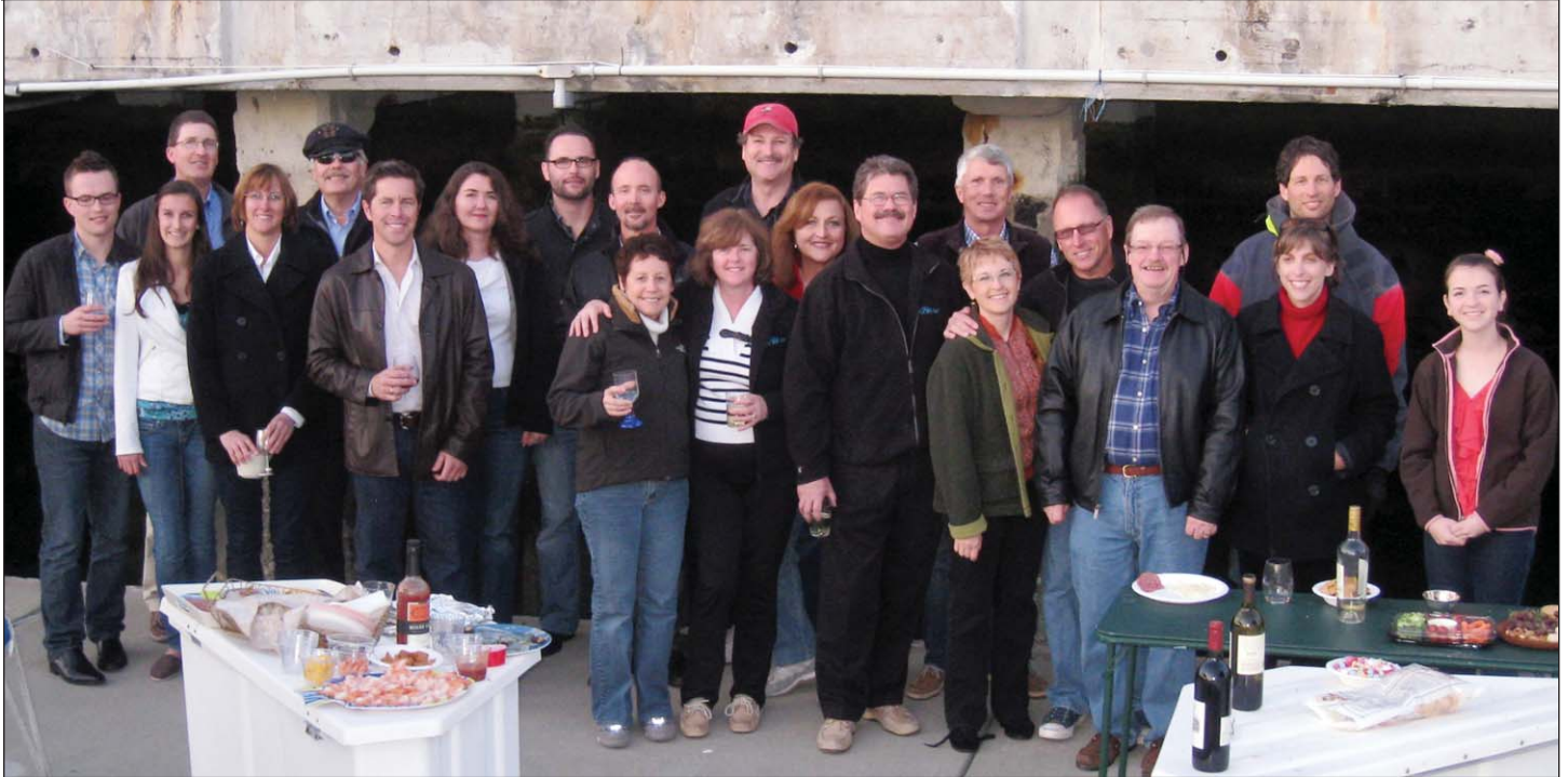
Group photo at the Jack London Cruise Out.