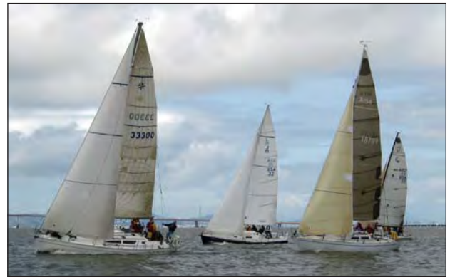
Redwood Cup photos from Tim Petersen