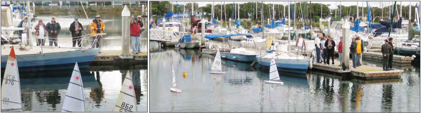
Itsy Bitsy Cup Regatta sailed in our marina, won by Doug Murray

The Deck Project continues: What a beautiful day for tearing out the old and reinforcing the supports