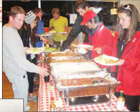
McIntyre Regatta dinner for over 100 collegiate sailors who competed over the first weekend in March.